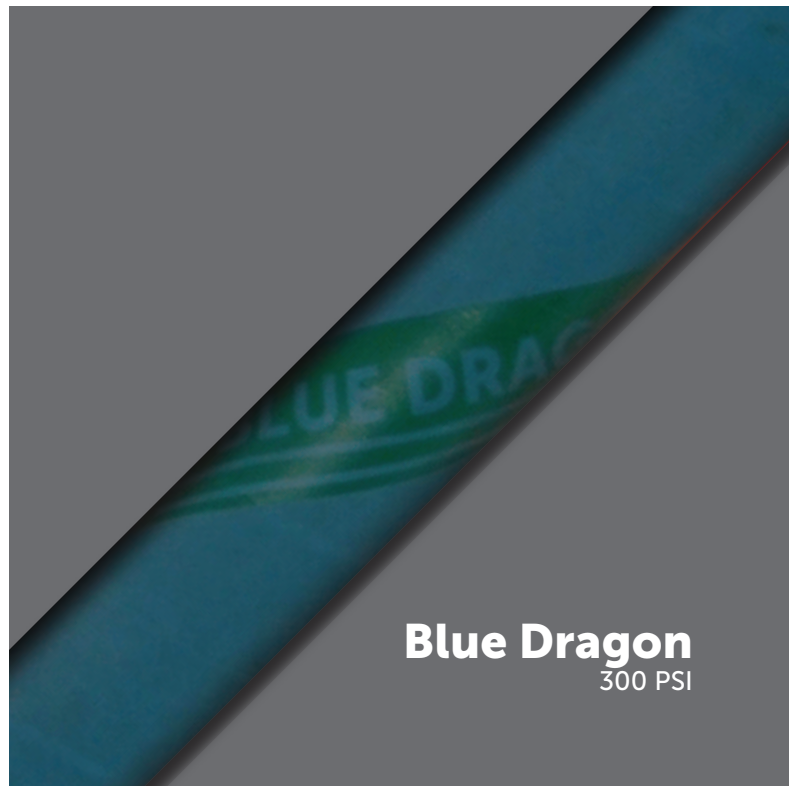
Blue Dragon 300 PSI