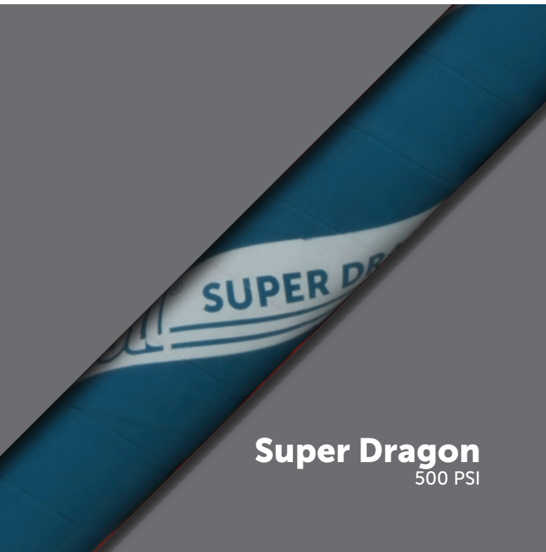
Super Dragon 500 PSI